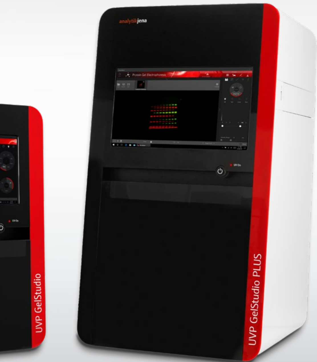
UVP GelStudio PLUS