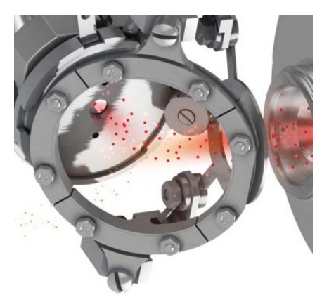
Figure 1: 90 degree reflecting ion optics system with ReflexION

The ReflexION is engineered to prevent all parts from contamination. This guarantees a maintenance free operation of all components in the high vacuum area of the PlasmaQuant<sup>®</sup> MS.