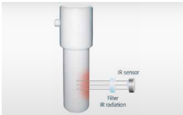
Measurement principle RTM

The Self Check System enables safe and maintenance-free operation, allowing you to fully focus on your work. The SCS combines all control functions in perfect harmony. Sensors monitor the electrically locked safety cover as well as the electronics and the magnetron. The SCS proactively prevents the occurrence of dangerous operating states, for example, by using the SMART algorithm. A safety shut-off device also provides that the operator and device are protected in the event an operational malfunction occurs.