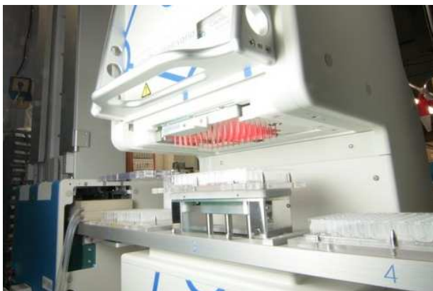
Figure 1: The CyBi®-Well vario Capillary Head with inserted 96 capillary magazine and 50 nl capillaries as well as a summary of the different capillary types.

In this Technical Note precision data are summarized which were measured during CyBio's in-house quality control check of different 96-capillary type magazines.